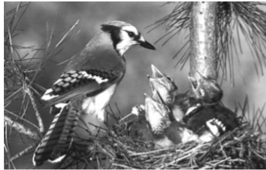
Baby chicks depend on their mother bird for food.