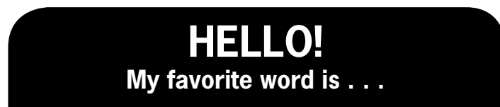
Figure 2. Favorite Word Nametag

To facilitate word awareness, students wrote their favorite focal word on a nametag (see Figure 2) and justified their choice in discussion with a partner. Students then wore the nametags to the RB session to share with the Little Buddy (Little Buddies drew their favorite word on the nametag; a similar technique could be used by ELLs with lower levels of English proficiency, or students could both draw and write the word to reinforce their understanding of the word meaning). Buddy pairs discussed their favorite words at the start of the RB session. To link word awareness and kinesthetic learning styles, teachers prompted students to indicate, by snapping fingers, when they heard one of the focal words in another part of the school day.